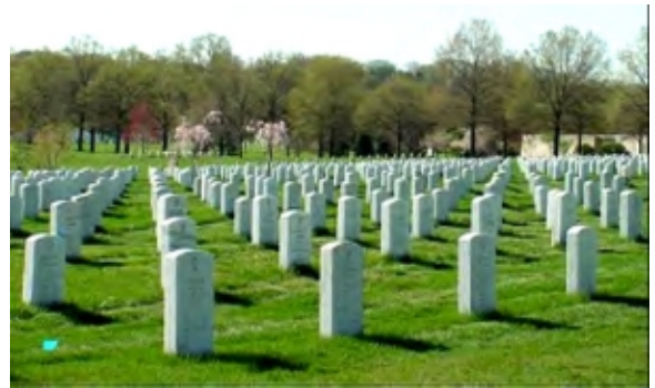
Death by government.

It is a mistake, moreover, to assume that national wealth requires bigness. A tiny country can be wealthy so long as it is integrated into the world economy. Switzerland is far richer than Brazil, and