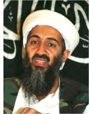
Famous white terrorist.

quickly move to reclaim its Western European (read white, Christian) roots, America will soon become what he calls a “cleft” nation. Cleft nations are riven by chronic internal conflict and disunion. This happens when countries abandon the religious, cultural, racial, and historical structures on which they were founded, and on which their very survival depends.