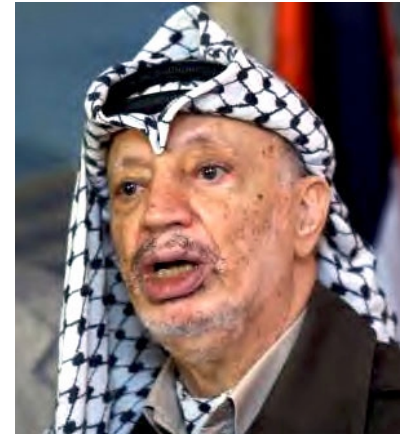
. . . according to the census bureau.

one box for “Other Pacific Islander,” which also requires a written entry. The bureau classifies all who checked one of the four Pacific Islander boxes as “Native Hawaiian and Other Pacific Islander,” and all who checked any of the seven Asian boxes as “Asian.” For the latest census, the bureau created a seventh category for people who chose more than one box: “Two or More