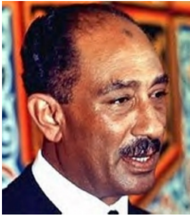
Famous white men . . .

Everyone has by now seen the pictures of the September 11 terrorists. They were all swarthy, black-haired Middle Eastern-looking men in