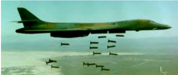
How we like to spread multiculturalism.

As Prof. Huntington explains, cleft societies lose the power to control their own destinies. They are only as culturally strong as their weakest cultural link. In America, multiculturalism has ad-