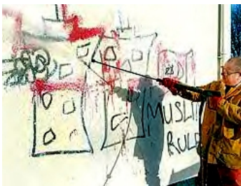
Cleaning up afterwards.

Wall, Wolverhampton Express & Star, Feb. 5, 2002.]