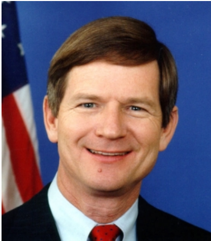
Congressman Lamar Smith.

ously with illegals. He has sponsored legislation to establish a new National Border Security Agency, to be run by flinty-eyed men whose job it would be to keep illegals out. The “immigration