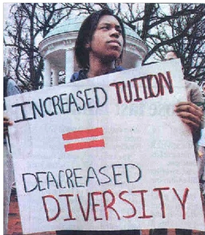
In January, the University of North Carolina at Chapel Hill announced a $400 increase in tuition for the 2002-2003 academic year, prompting the above warning. “Decreasing” diversity well may lift academic standards.