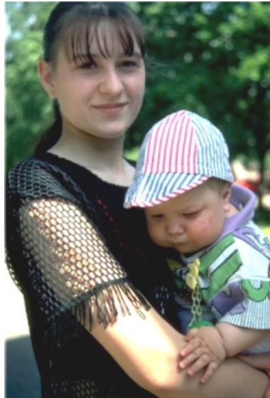
Problem or possibility?

“non-Hispanic whites”) are 60.9 percent of the American population age 17 and younger, in 1999 whites accounted for just 44.3 percent—a minority—of births