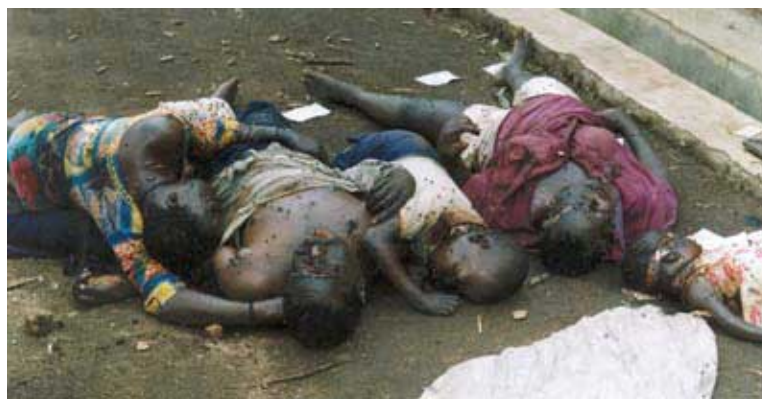
What some of them left behind in the Congo.