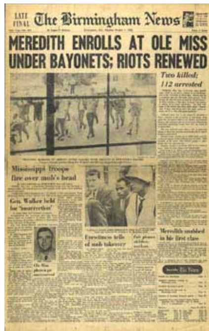
Front page, Oct. 1, 1962.