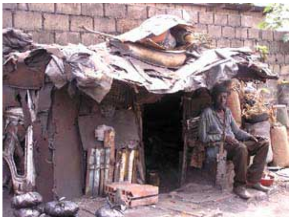
From Kinshasa . . .

of the store manager while another kicked a customer violently in the stomach. The gang dragged the two to the back of the store and tied them up, while they brandished weapons at the other customers. Black Démolition collected wallets, cell phones, car radios, DVD readers, and 2,055 Euros from the cash registers, and roared off in the store manager's Ford.