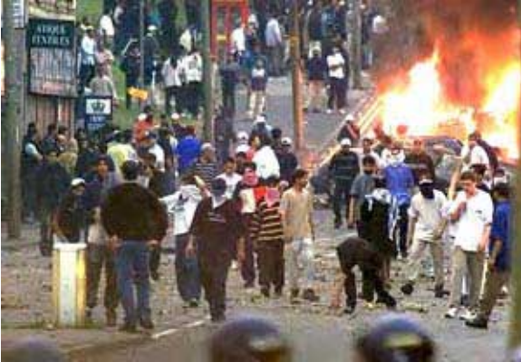
Asians rioting in Bradford, 2001.

The government panicked, halting all applications from Romania and Bulgaria. On April 6 and 27, Prime Minis-