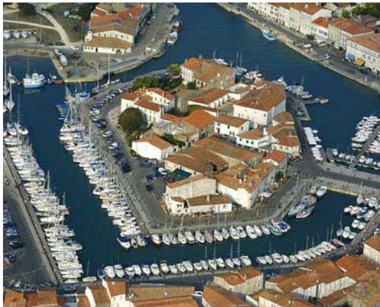
Ile de Ré: Where old Socialists go to get away from multiracialism.

It is perhaps with blacks that the European elite maintains, to some degree, a genuinely colonialist mentality. Our rulers came of age when there were still