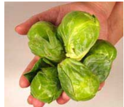
The city is known for something else now.