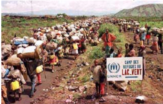
Congolese refugees: How many will end up in Europe?