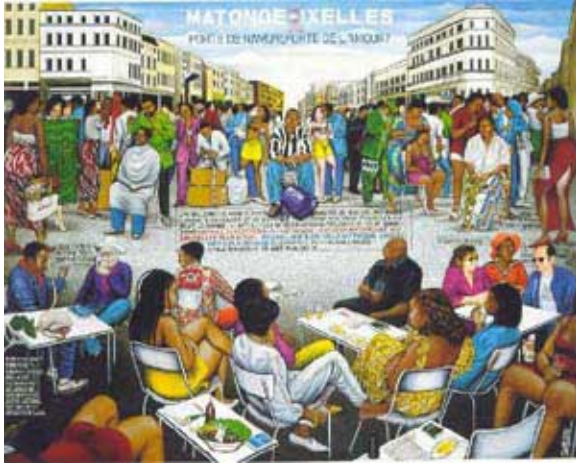
The famous Matongé mural.

In 2001, a gang with the unlikely name of Les Japonais (The Japanese) made a brief bid for power. Two of its members made a spectacular haul when they grabbed a briefcase with more than three million Euros from a businessman who had just made a bank withdrawal. They