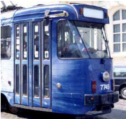
Brussels streetcar: a good place for impromptu surgery.

Operation Alpha proceeded without incident but without much success: The police issued a dozen summonses that went nowhere, and seized a few knives and a small amount of drugs. Still, it was a sign of the times. By 2001, Congolese criminals were beginning to make a name for themselves. The police and even the public were beginning to no-