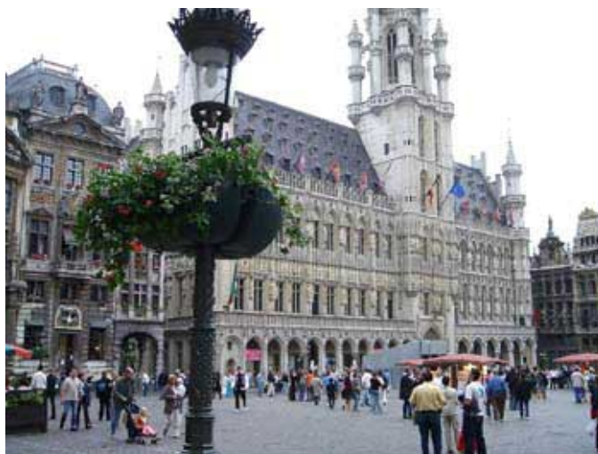
. . . to Brussels.