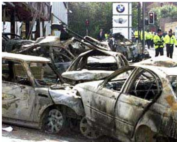
Bradford rioters burned every car at a BMW dealership.

Most ambitiously, however, he includes an interesting analysis of why mass immigration can bring on “crowding stress.” It is well known that in times