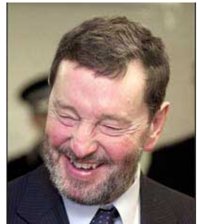
Ex-Home Secretary David Blunkett.