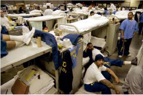
The Supreme Court insists on integration.

A man who served four years in a California prison wrote an article for the Los Angeles Times called "Why Prisons Can't Integrate." "California prisons separate blacks, whites, Latinos and