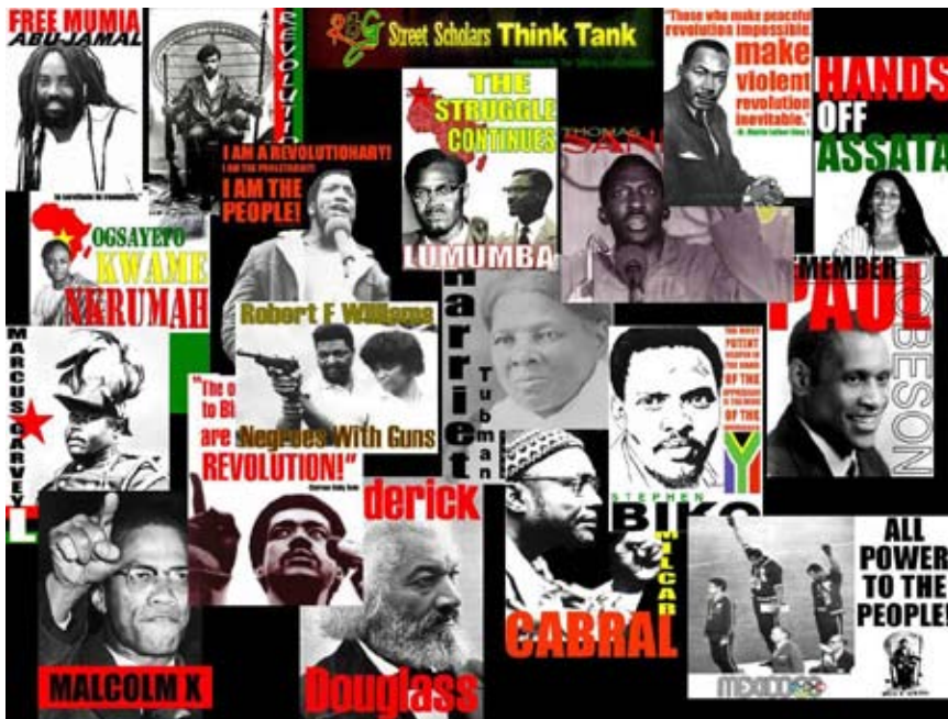
He thought there was a little too much of this.