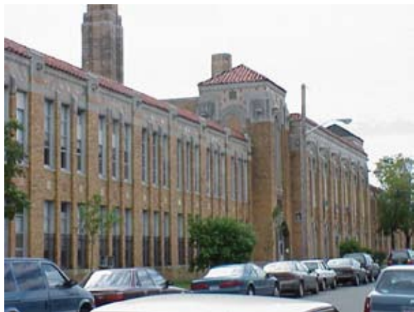
Hamtramck High: Arabs and blacks do not get along.