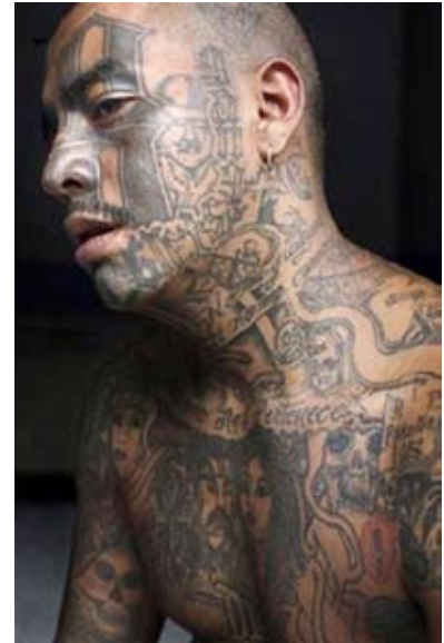
Your new roommate for the next 90 days.

attacks in three different dormitories to retaliate for the beating they took during the April riots that led to segregation. The next day, Hispanics in three other dormitories attacked black prisoners. Twenty-two men were hurt and two