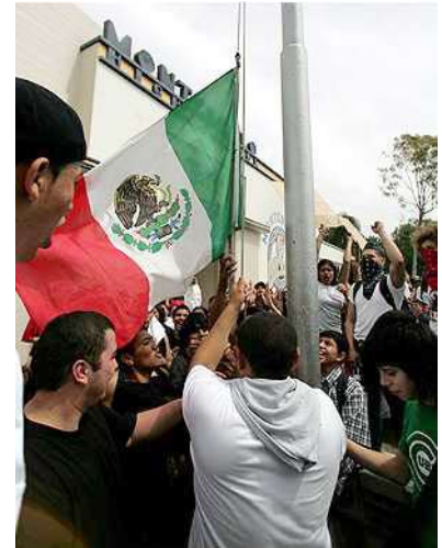
Flags are now the equivalent of gang colors.

scale marches demanding amnesty for illegal immigrants. Officials said flags were being used to taunt other students and stir up trouble. It is difficult to think of diversity as our country’s greatest strength when it forces a school district to treat Old Glory as if it were a display of gang colors.