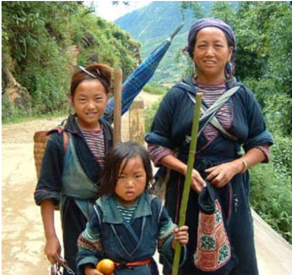
Hmong in their natural habitat.