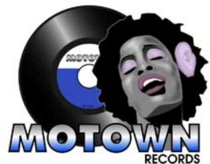
Prison ruined Motown for one inmate.

“[I]n the aftermath of the Byrd murder [the 1998 dragging death in Jasper, Texas] I read one commentator’s opinion in which he expressed disappointment that ex-cons could come out of prison with unresolved racial problems ‘despite the racial integration of the prisons.’ Despite? Buddy, do I have news for you! How about because of