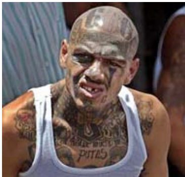
Guatemalan gang member.

Racial tension often flared into violence, and up until they started using effective, non-lethal crowd control equipment around 2000, guards routinely put down brawls with live fire. On February 23 that year, when 200 blacks and Hispanics at Pelican Bay State Prison started slashing each other with home-made knives, guards could not control the fighting with tear gas or pepper spray. They shot 15 inmates, killing one and critically wounding another. Prisoners still managed to stab at least 32 fellow inmates.