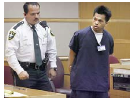
Asian gang member.

When California firefighting crews are overwhelmed, they occasionally get help from prisoners, but they are not always much use. In December 2007, white and Hispanic prisoners who were supposed to be fighting the Poomacha fire in San Diego County ended up fighting each other and had to be pulled off the job, just when they were needed most. The fire burned 50,000 acres and 217 homes and other buildings.