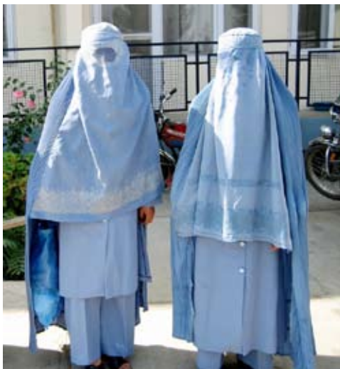
Increasingly common in Europe.

Halal is run by Muslims for Muslims, so non-Muslims have no share in the