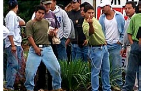
These Mexicans seem well assimilated to us.